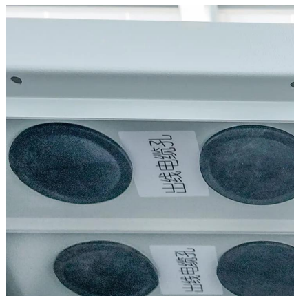
ABB central inverters PVS800 - 500 to 1000

Solar inverters from ABB ABB central inverters are ideal for large PV power plants but are also suitable for large-sized power plants installed in commercial or industrial buildings. ...